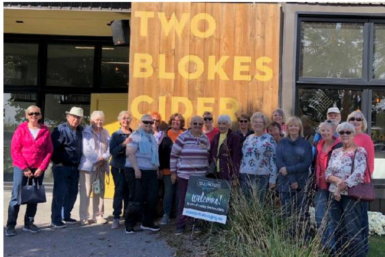
Members enjoying the day at Two Blokes Cider.