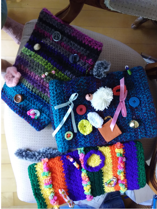
Busy Muffs- created by our crafters. The variety of shapes and textures can quiet frazzled nerves.