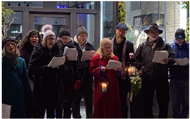
Carollers on Queen Street during the town's tree lighting ceremony.