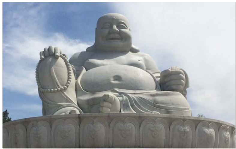
June 2019. Club trip to the Buddhist Monastery in Bethany.